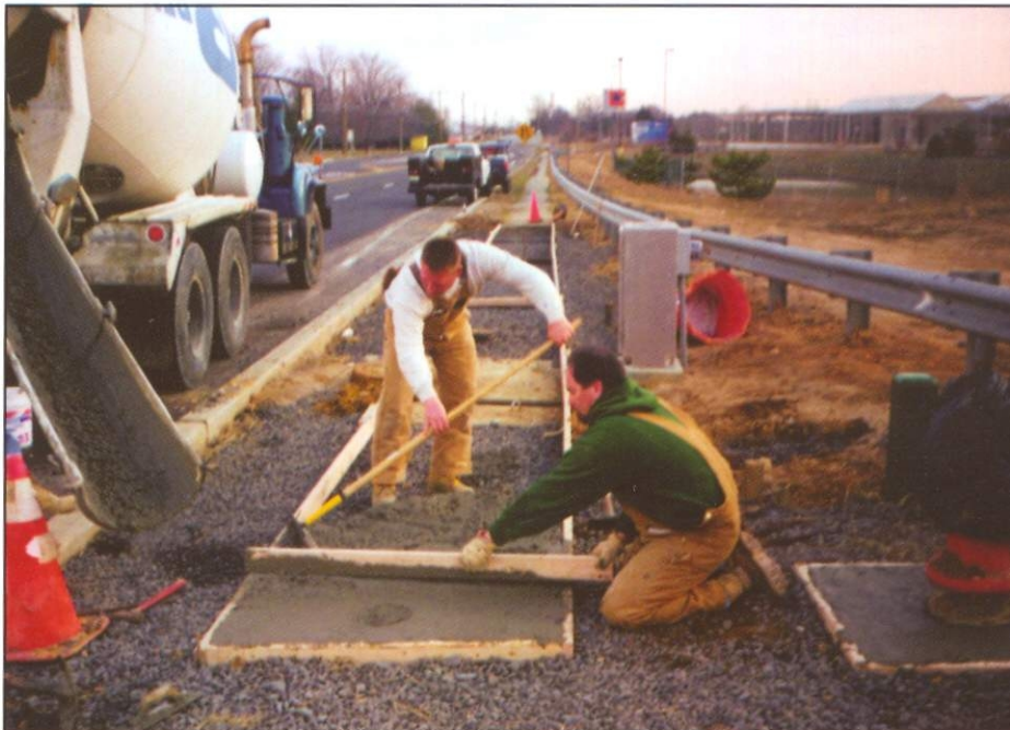
West Bay personnel complete concrete placement in conjunction with water main installation.

storm drainage and a pedestrian bridge installation.