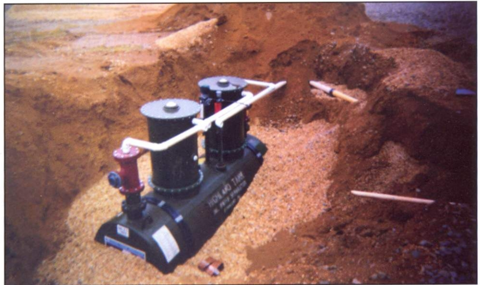
Water separator installed at the NJ National Guard facility in Vineland.