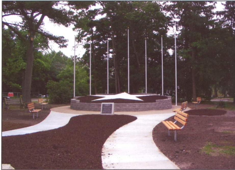
Veterans Memorial Park constructed by West Bay Construction Pleasantville.

Within two years, the firm expanded its market to also include work in Gloucester, Cumberland and Camden counties. This work was often performed as a subcontractor and included the construction of timber bridge foundations, test pile installations,