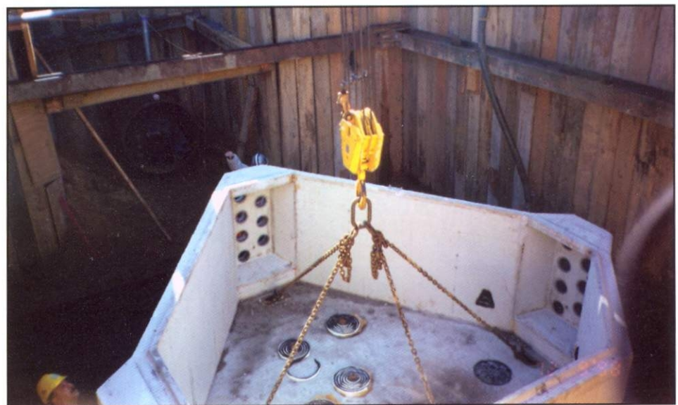
Junction box installed by West Bay for PSE&G.