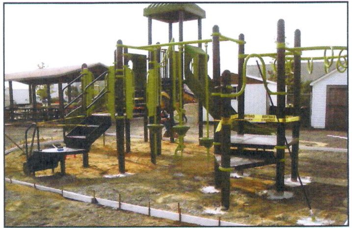
A playground is constructed for the U.S. Air Force at the Joint Base McGuire-Dix-Lakehurst.

The company also has extensive utility work experience, including clients such as PSE&G and local municipalities. These projects have also included concrete repairs, drainage improvements and road repairs. In June, West Bay completed the rehabilitation of the Sugar Hill Bridge in Mays Landing for the County of Atlantic. Utility and Transportation Contractor, AUGUST 2014