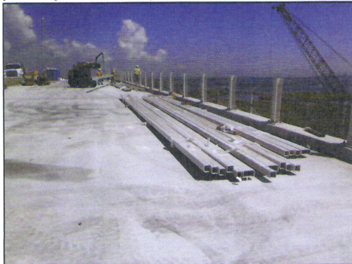
West Bay installs bridge and pedestrian rails on the Route 52 project.

to South State. During its first year in business, West Bay completed a dozen projects as both a general contractor and a subcontractor. The firm performed utility work, site work, sidewalk installations and concrete repairs in Atlantic and Cape May Counties. A short time later, the contractor also began working in Camden, Gloucester and Cumberland Counties. The firm's capabilities expanded during this time to include timber bridge foundations, structural concrete and pedestrian bridge construction. Other early projects included water main installations in Brigantine and utility improvements on NJ Turnpike Service Plazas at Interchanges 4 and 6.