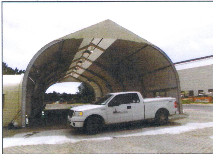
Entrance Canopy is completed at the Joint Base McGuire-Dix-Lakehurst.

In recent years, West Bay has carved a niche with the completion of numerous military contracts including the US Coast Guard and Joint Base MDL. One of the first of these projects included the construction of pump station foundations in Wildwood for the U.S. Coast Guard. Later, the company successfully completed a bulkhead repair where they drove steel sheet piles for the USCG Station Indian River in Delaware. West Bay successfully completed a project located at the main entrance of the United States Coast Guard Training Center in Cape May, NJ. This project consisted of the demolition of existing fence/gates and the installation of a new high security gate/fence featuring new masonry walls, concrete flatwork and a vehicle inspection area. Projects for the US Coast Guard have also included the demolition and replacement of a floating dock in Barnegat Light, NJ and the installation of navigational range towers on the Delaware River. Additionally, West Bay completed a $750,000 renovation at the US Coast Guard Base in Cape May, where it rehabilitated the gymnasium.